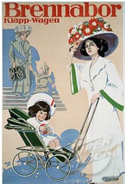
Prams and folding buggies